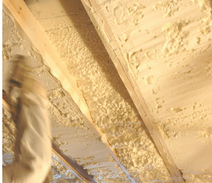
Icynene is installed in adherence with local building codes. Once applied, finished appearance may vary from photo shown.