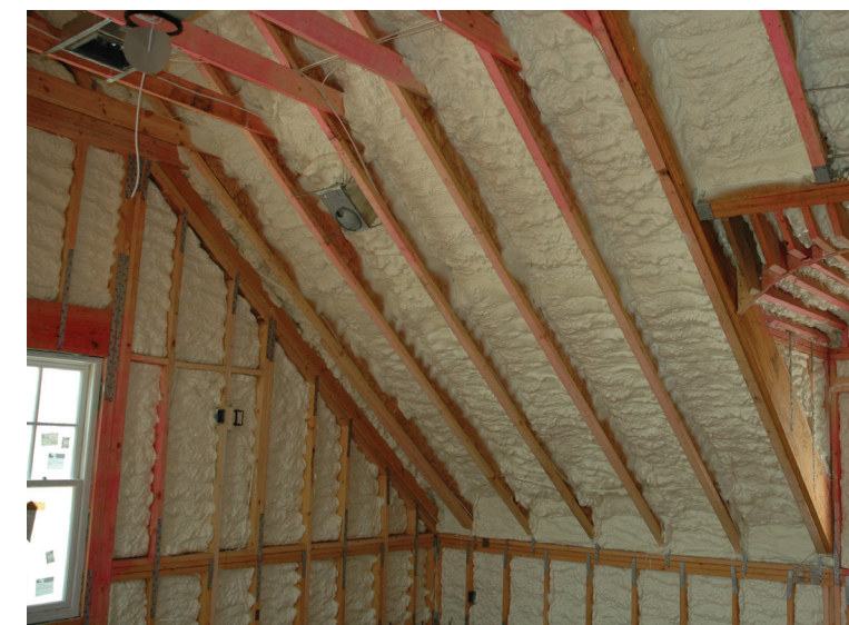
Icynene is installed in adherence with local building codes. Once applied, finished appearance may vary from photo shown.

For areas that require insulation with a lower vapor permeance, Icynene's Medium Density products are available. These products are ideal for use in areas with higher levels of humidity, such as crawlspaces, or where a higher R-value per inch is required.