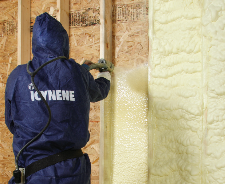
Icynene is installed in adherence with local building codes. Once applied, finished appearance may vary from photo shown.