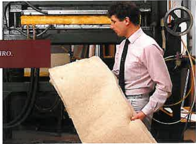
Thermal properties testing at CSIRO.

of products is available. Low density batts and blankets are very common and are highly flexible, which facilitates convenient installation. Rockwool is similar to glass fibre but the starting mineral is volcanic rock which is melted and spun into fibre. It is available in loose-fill form (without binder) for horizontal applications (such as ceilings) as well as batt and blanket form incorporating adhesive binder. Being denser these products generally offer good thermal performance for a given thickness but are otherwise similar in properties and use to fibreglass. Both have good fire performance as they contain only very small amounts of combustible material. They also have good sound-absorption qualities. They may cause temporary skin irritation and handling precautions should be taken.