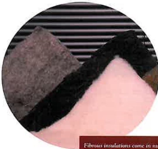
Fibrous insulations come in numerous colours and sizes.

Thermal insulation materials are broadly grouped into two categories – bulk and reflective.