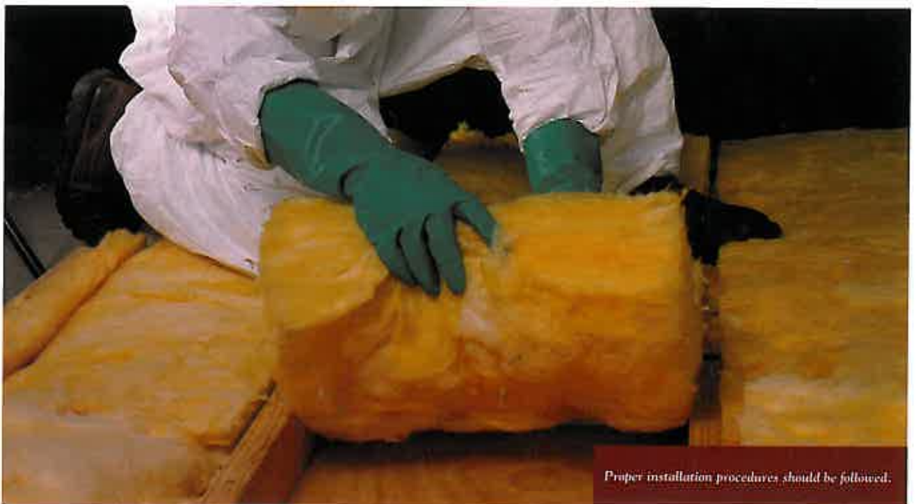
Proper installation procedures should be followed.